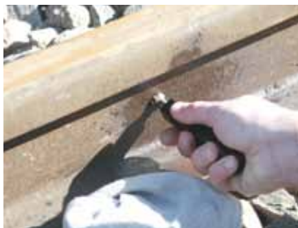
Clean the inside of the hole after drilling. A good contact surface has been created.