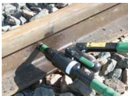
Place the bolt in the hole and apply the tool to it. Press the handle until you hear a click. The bolt is now firmly secured to the rail.