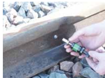
Fit the bolt. Make sure the tool is untensioned by pressing the handle. Screw the threaded rod onto the socket.