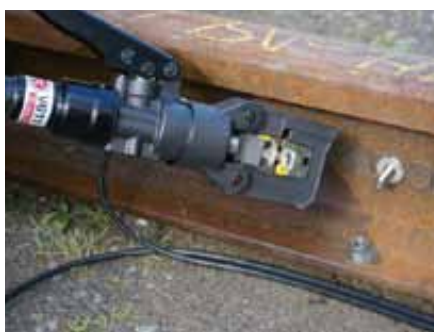
Crimp Elpress connection with associated tools.