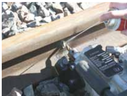
Drill the hole. Use cutting oil.