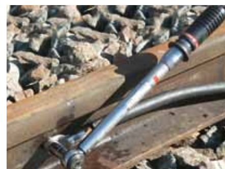
Place the copper connection on the bolt. Use the flat washer supplied, along with a self-locking nut and torque wrench. Always follow recommendations.